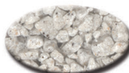
HGS360 Almond (4 mesh)