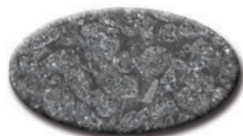
HGS320 Charcoal (4 mesh)

HGS special effect granules are similar to our standard Hylite Granules (HG), except the size is larger (appx. 4mm). Because of the larger size, they also have improved suspension. HGS granules can be added to granite fillers to allow you the option of offering a wider variety of textures. Granite Effect Granules have the effect of smaller particles inside large granules that are designed to be used with granite effect materials. These granules add a distinctive effect when used at levels as low as a 3% to 9% addition to your filler loading.