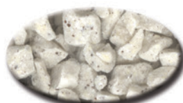
HGS350 Beach (4 mesh)