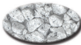
HGS321 Pewter (4 mesh)