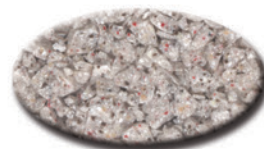
HGS340 Mahogany (4 mesh)